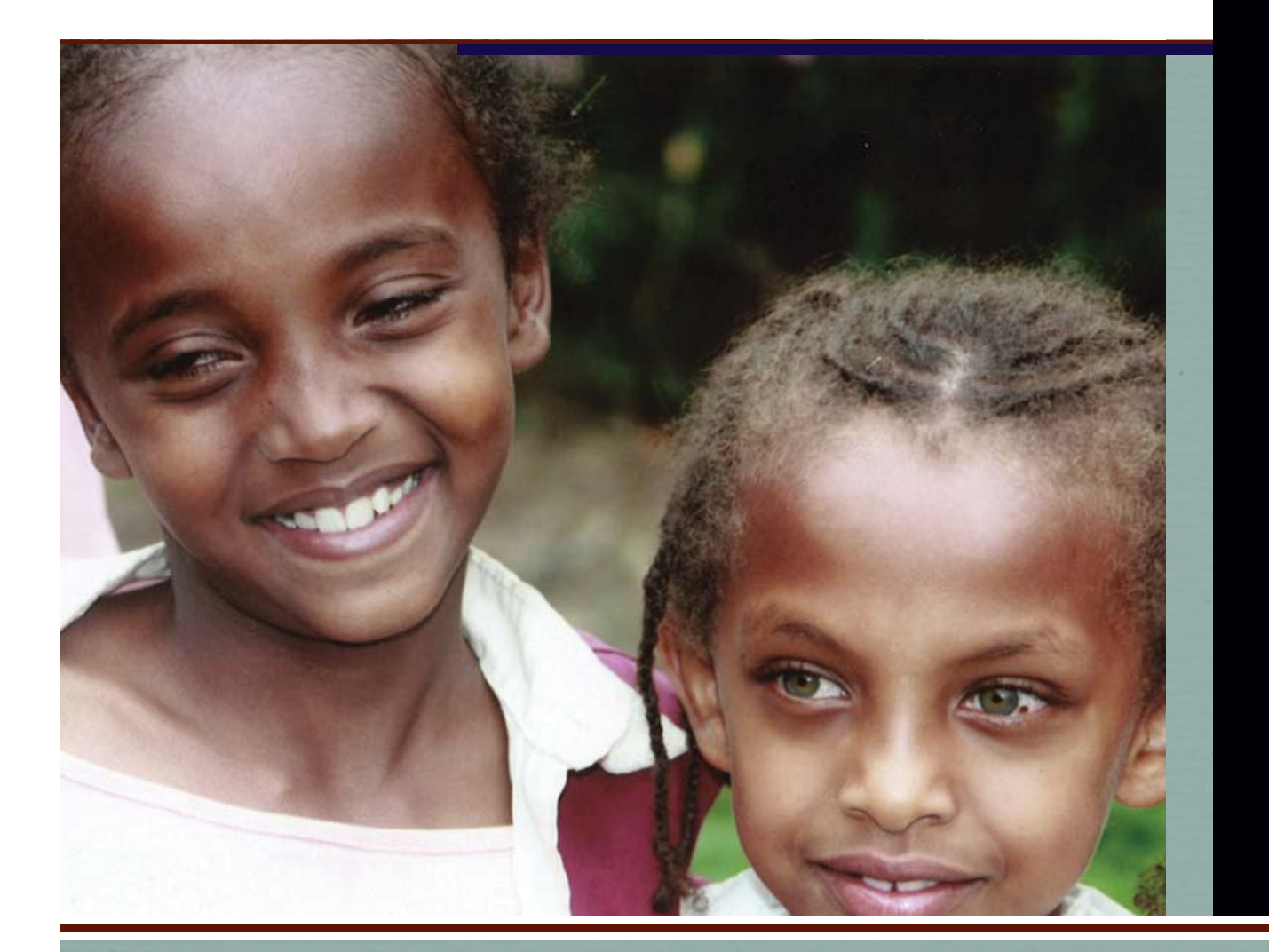
LOTT CAREY FOREIGN MISSION CONVENTION

Tamar's cry is a call for awareness, advocacy and action . . . today!